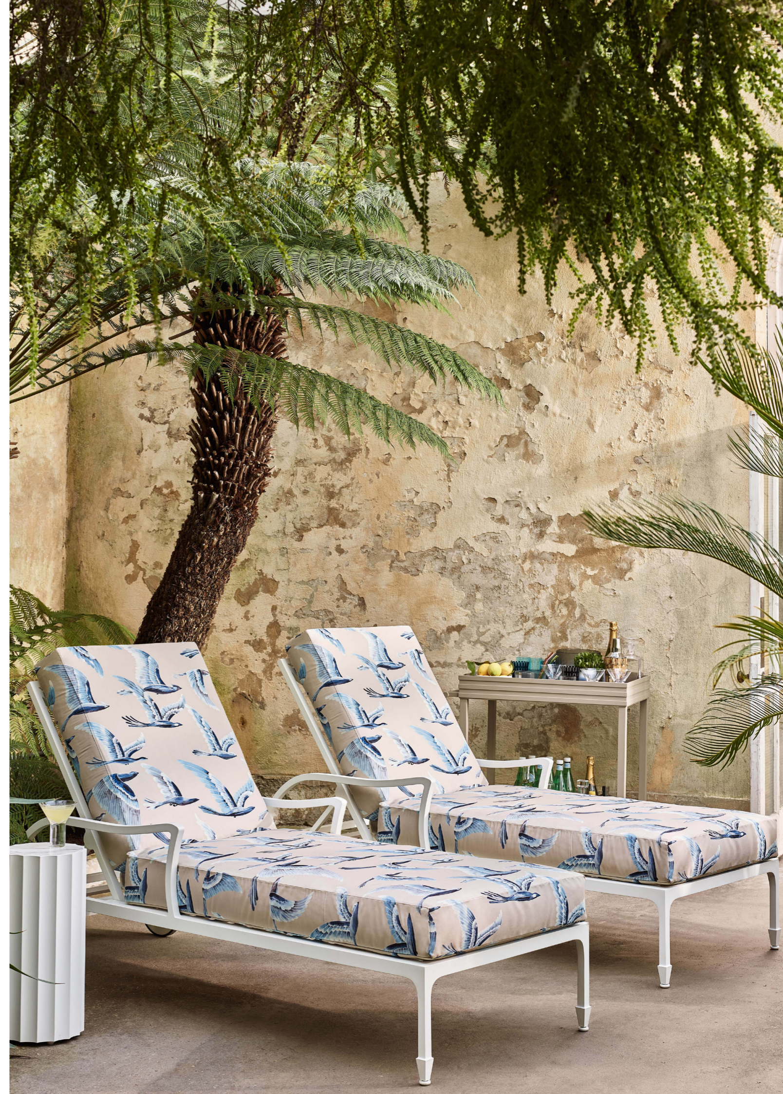
Sun loungers: HYDRA