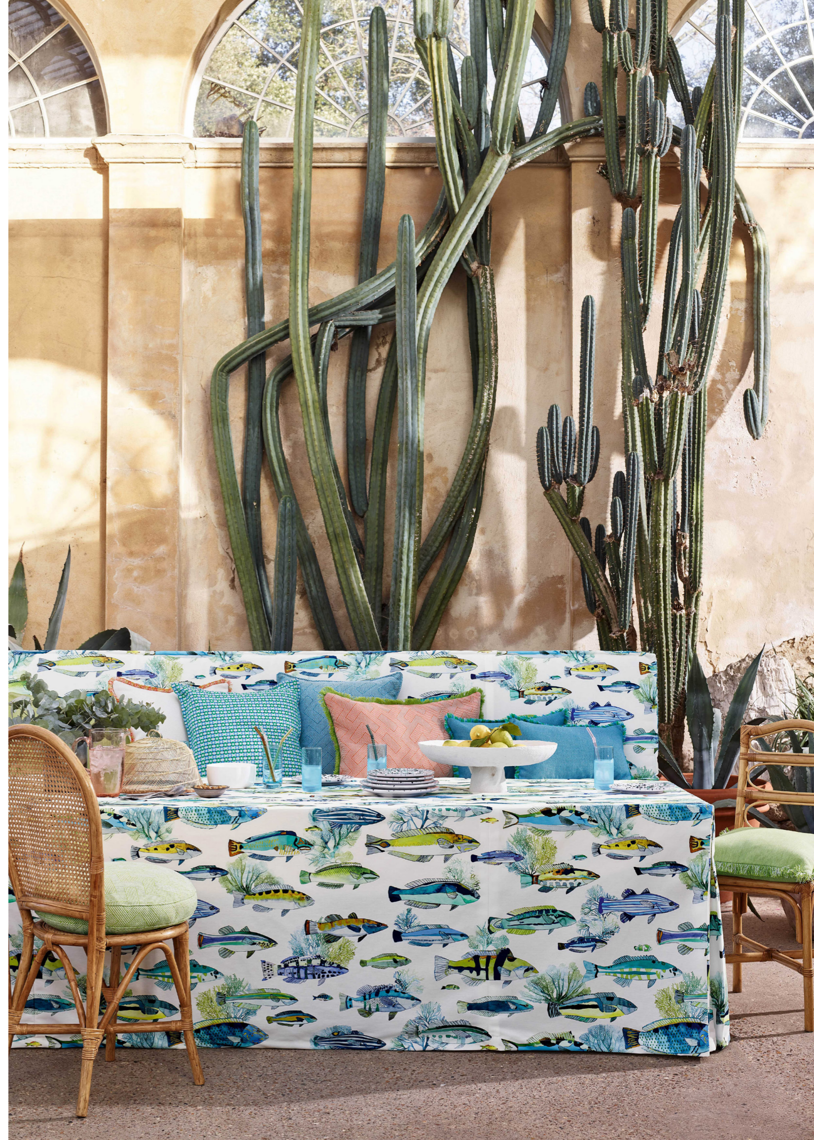
Bench & tablecloth: FIDJI Cushions (from left): LENI with BATAM fringe, BATAM, LOMBOK, LOMBOK with LENI fringe, LENI with BATAM fringe Chair (left): LOMBOK Chair (right): LENI