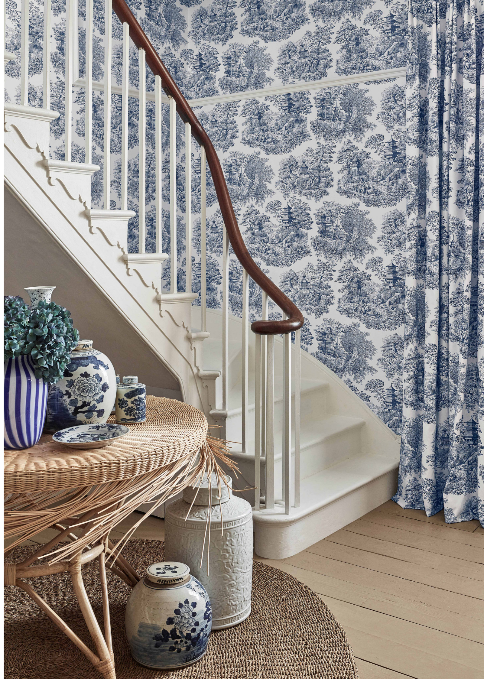
Wallpaper and curtains: NARA