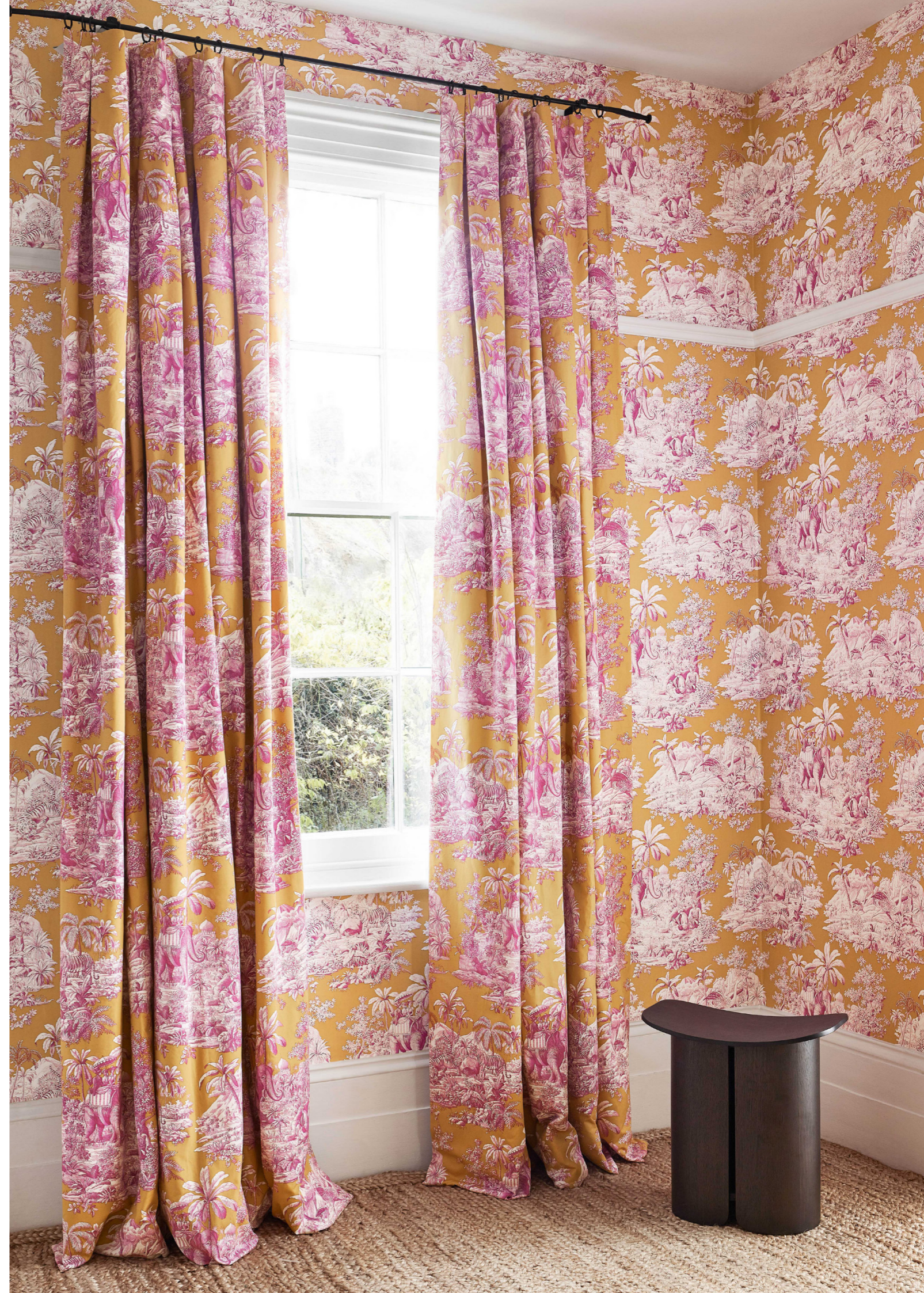
Wallpaper and curtains: BENGALÉ