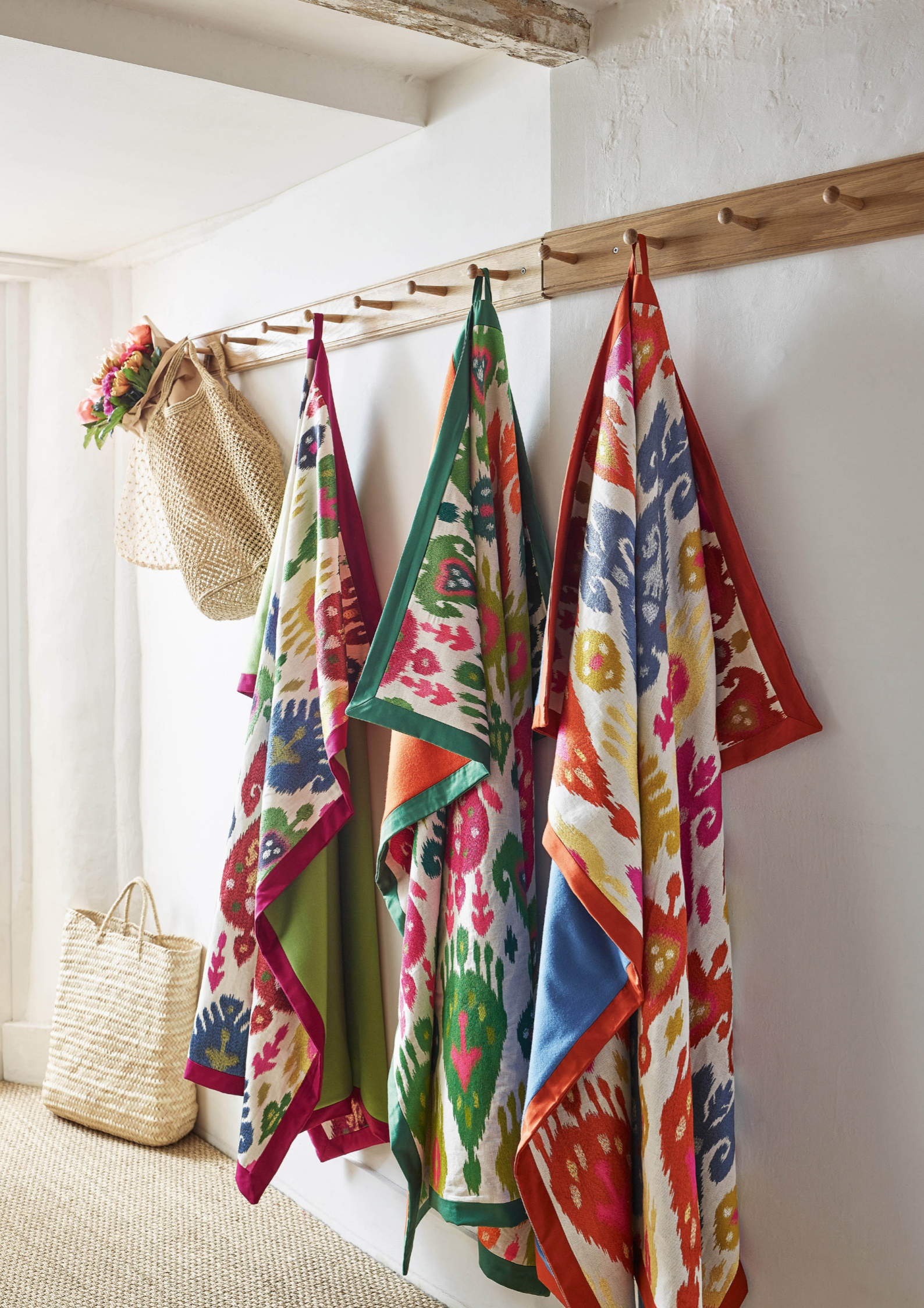
Blankets: THARA Lining: NURA Edging: NURA