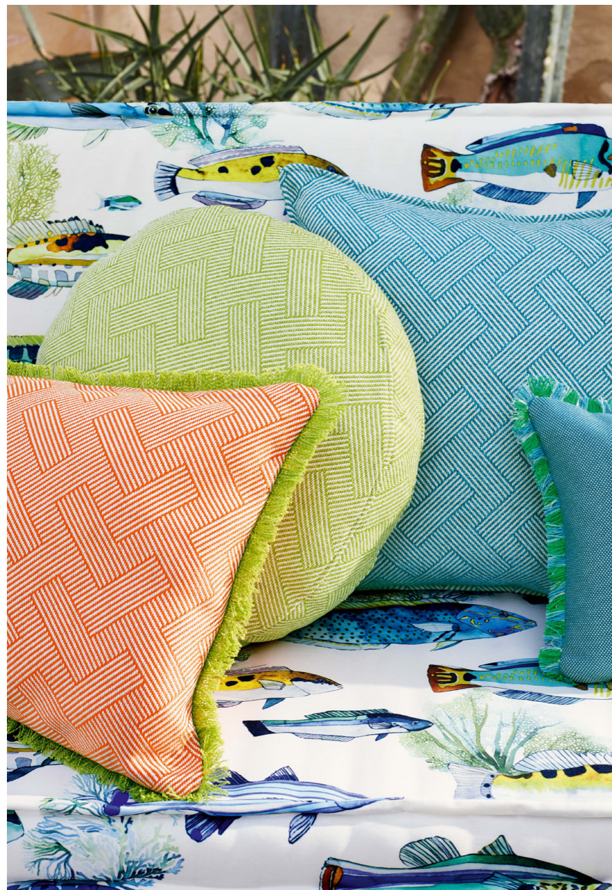
Bench: FIDJI Cushions (from left): LOMBOK with LENI fringe, LOMBOK CACTUS LOMBOK LAGON LENI with BATAM fringe