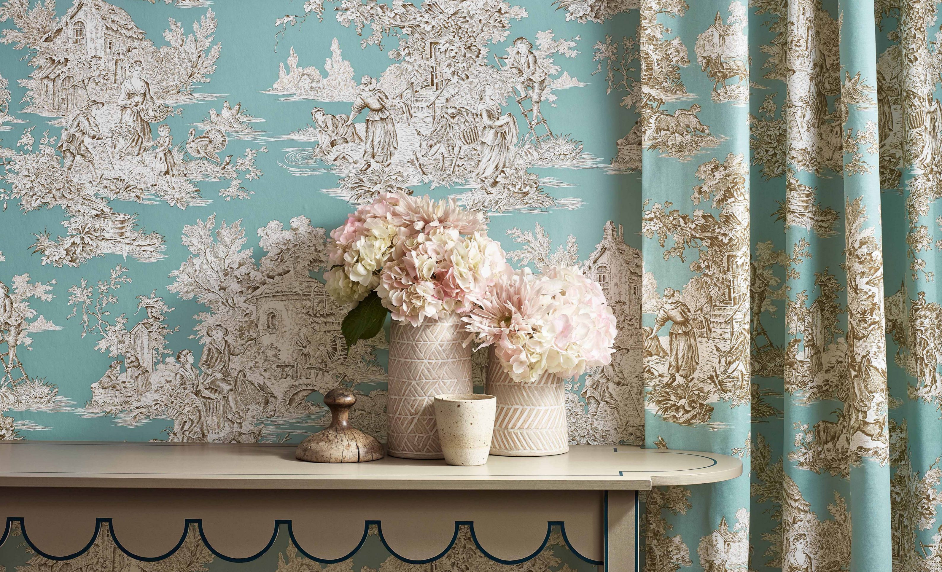
Wallpaper and curtains: CAMPAGNE