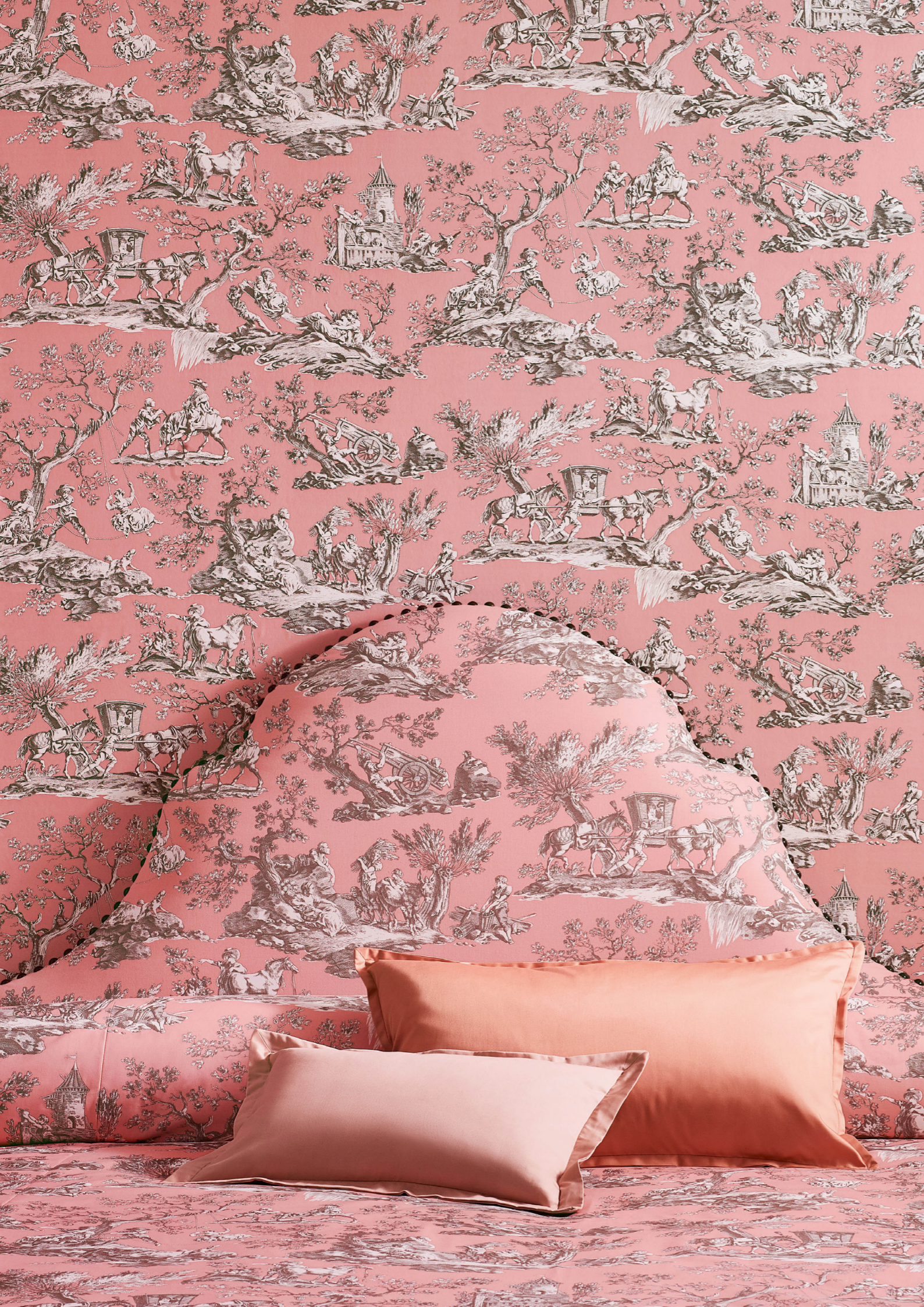
Wallpaper: LA MUSARDIERE Headboard & bedcover: LA MUSARDIERE Cushions: NURA