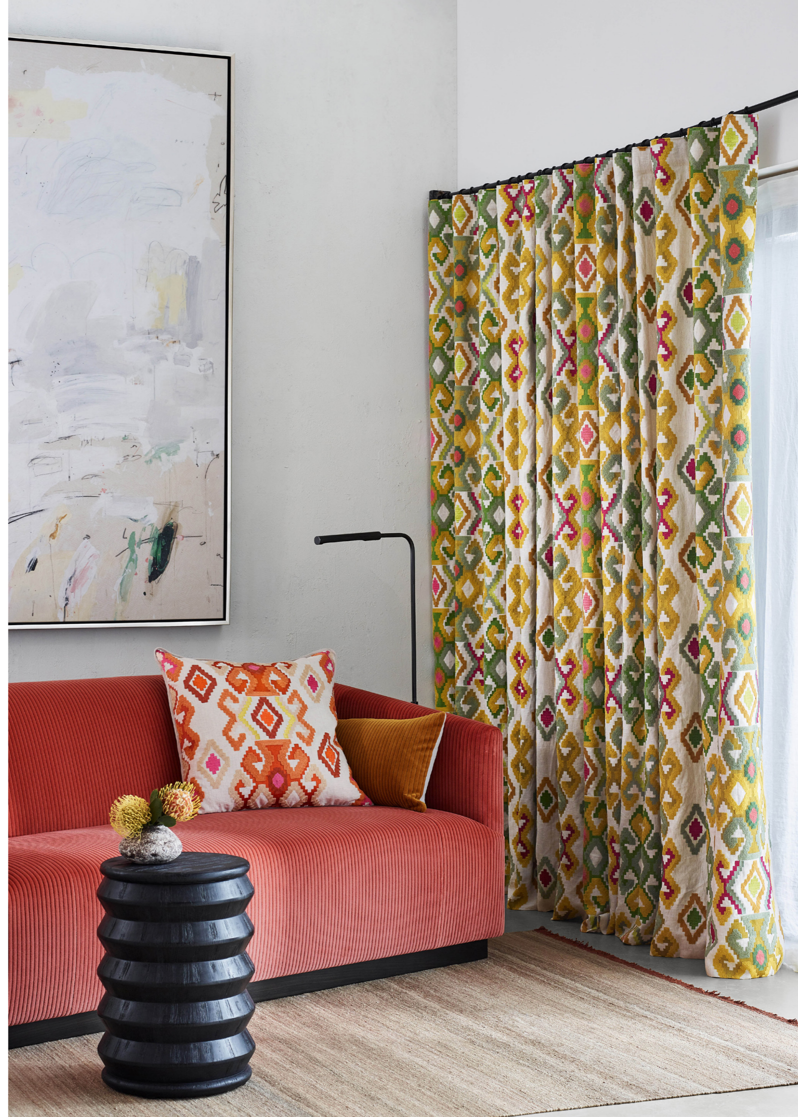
Curtain: ALBA Sofa: ROMA Cushions (from left): ALBA, ROMA