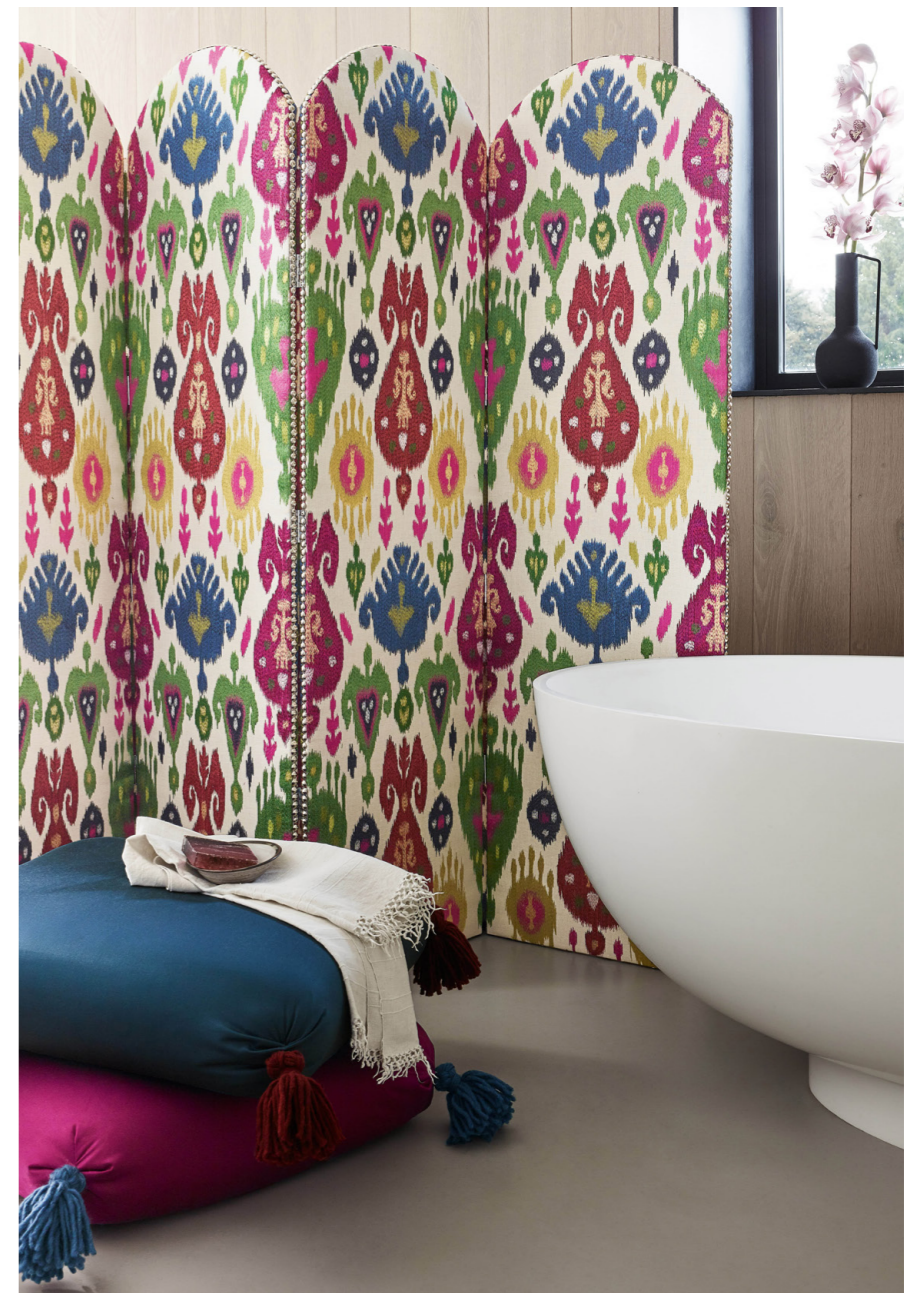
Screen: THARA Cushions: NURA