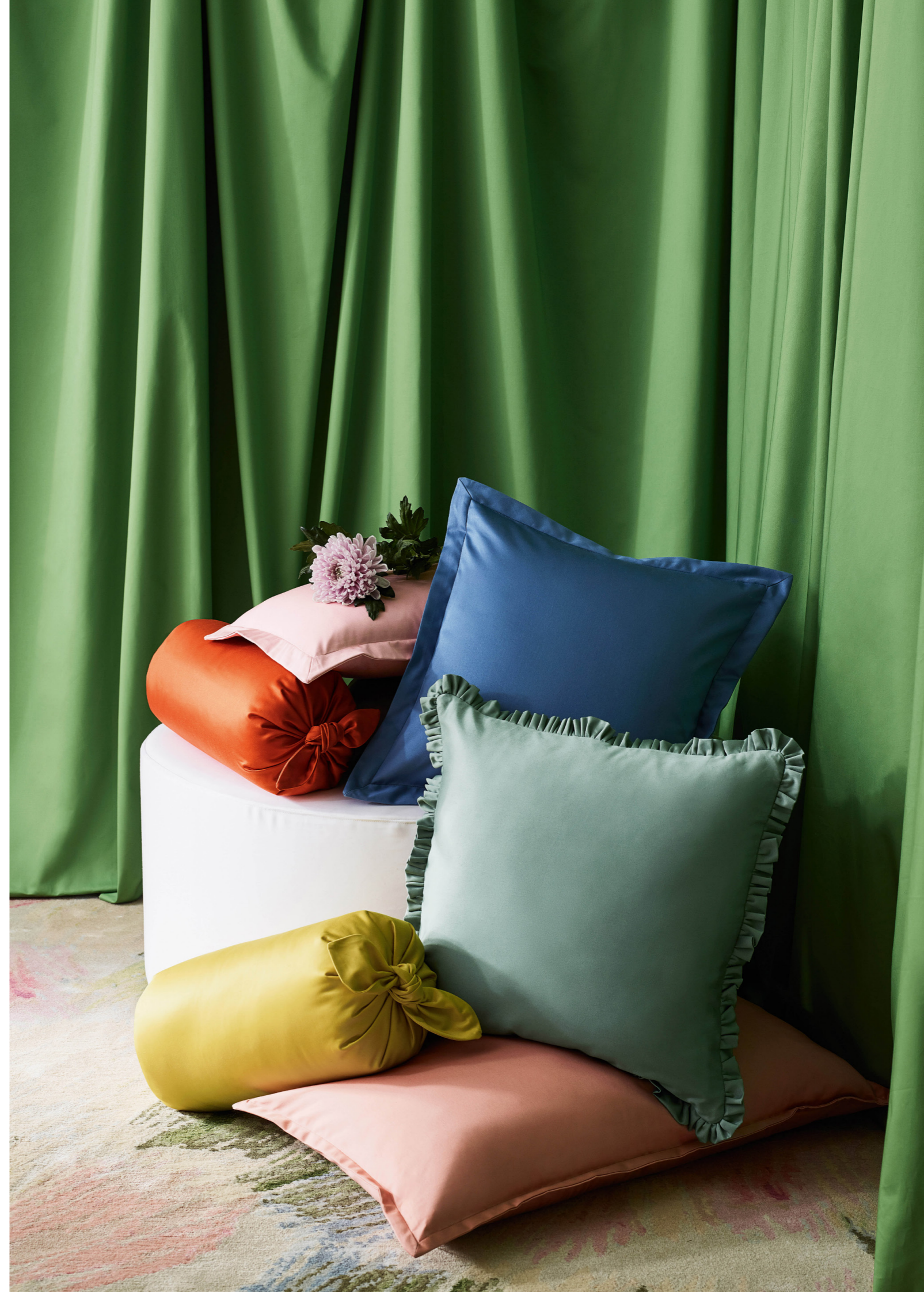
Curtains, cushions and ottoman: NURA