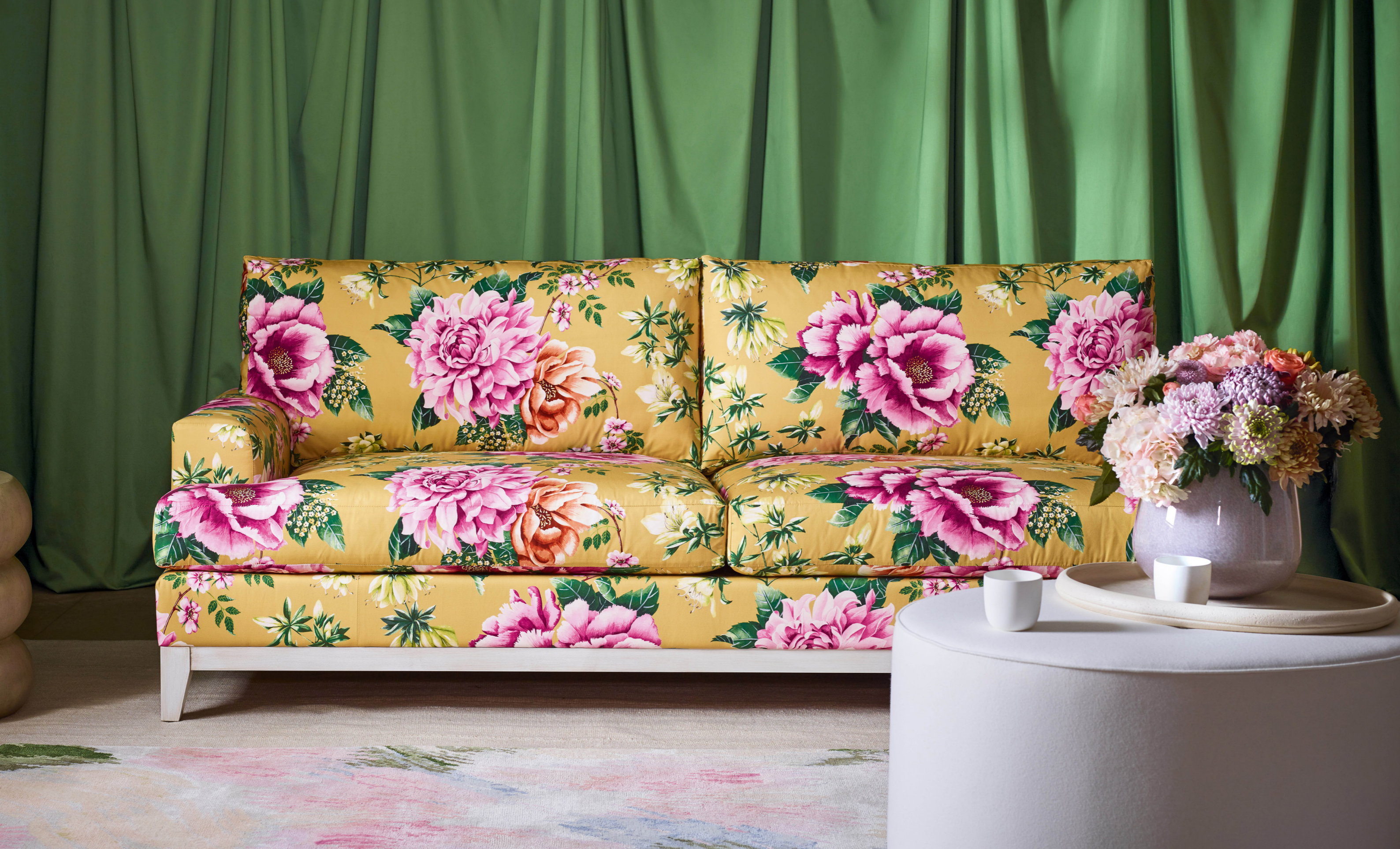
Backdrop: NURA Sofa: ALBA Stool: RIMINI