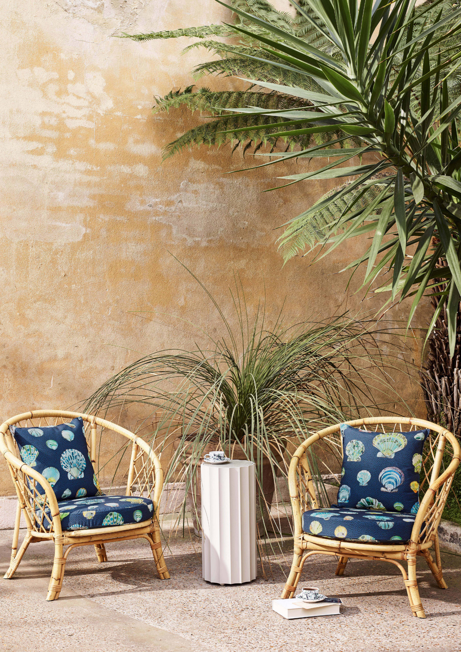
Seat cushions: BALI