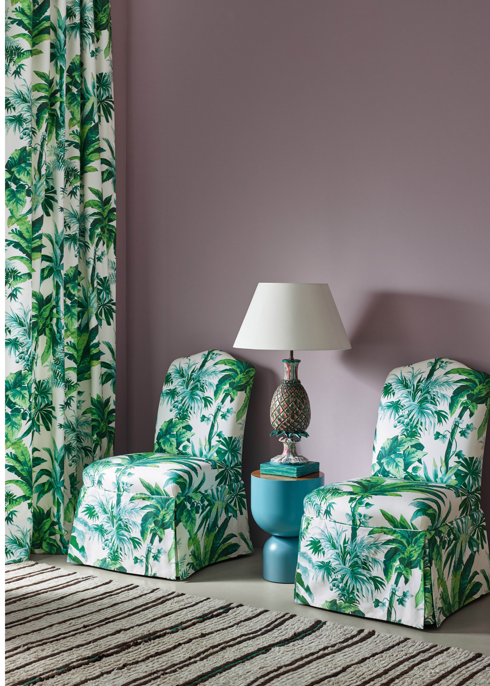
Curtain & chairs: MALACCA