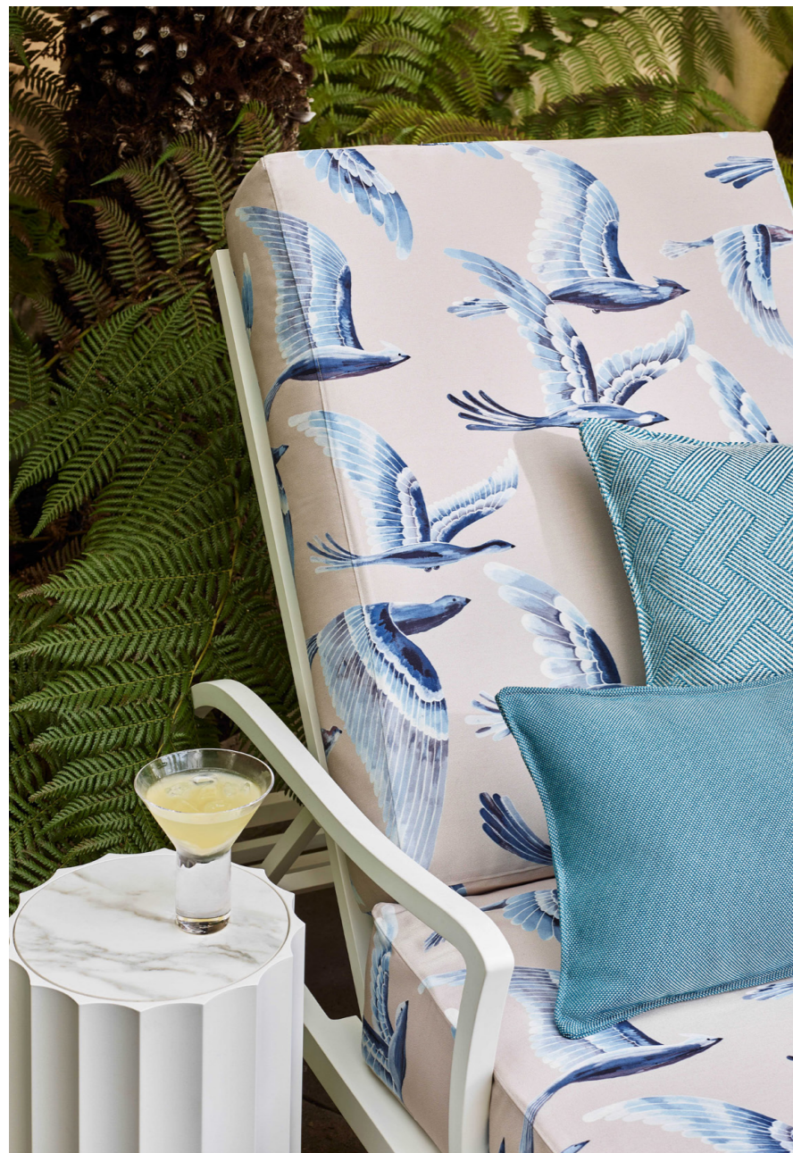
Sun lounger: HYDRA Cushions (from rear): LOMBOK, LENI