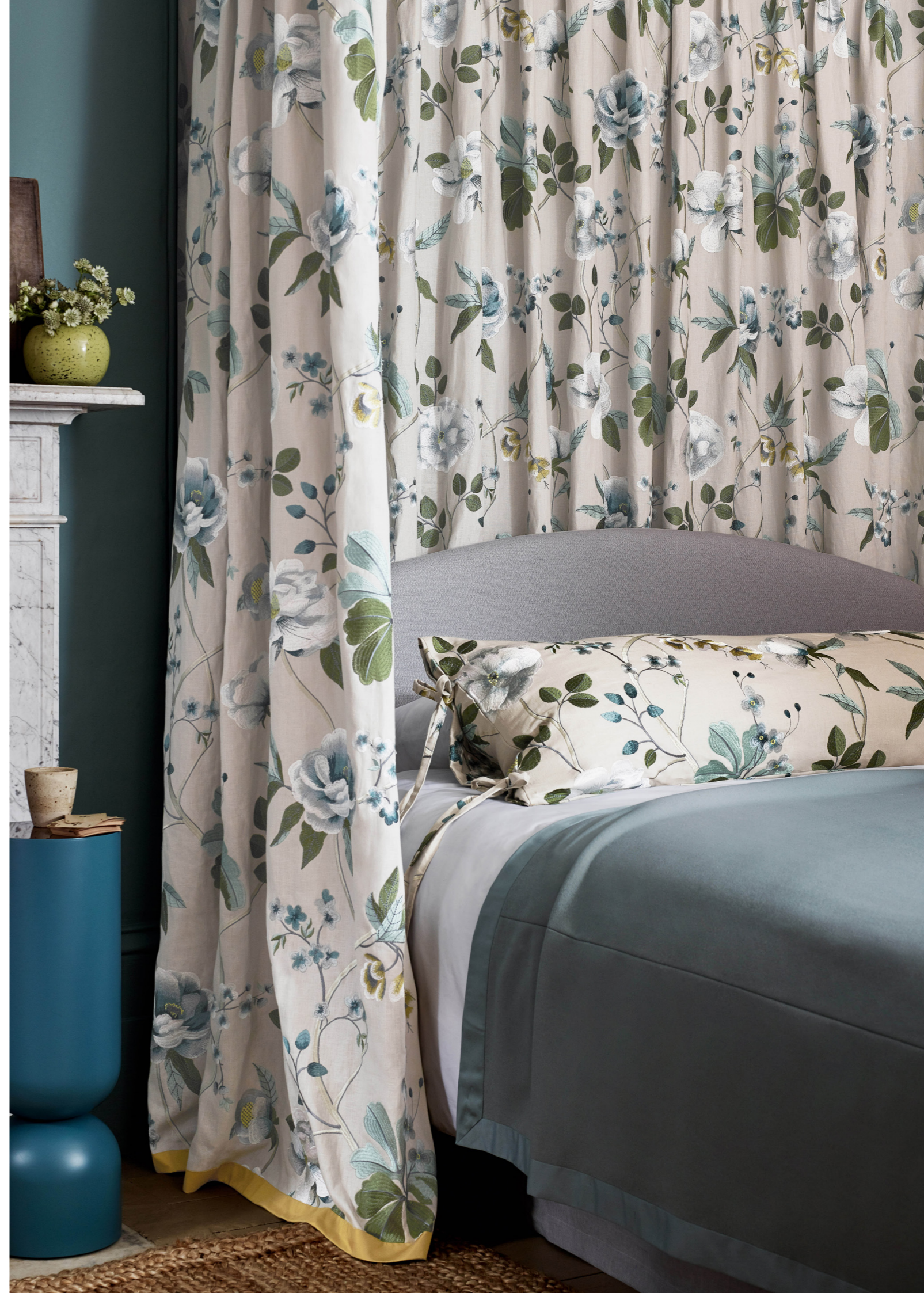
Curtains: TALMONT Headboard: SELMA Cushion: TALMONT Throw: RIMINI, edged in NURA